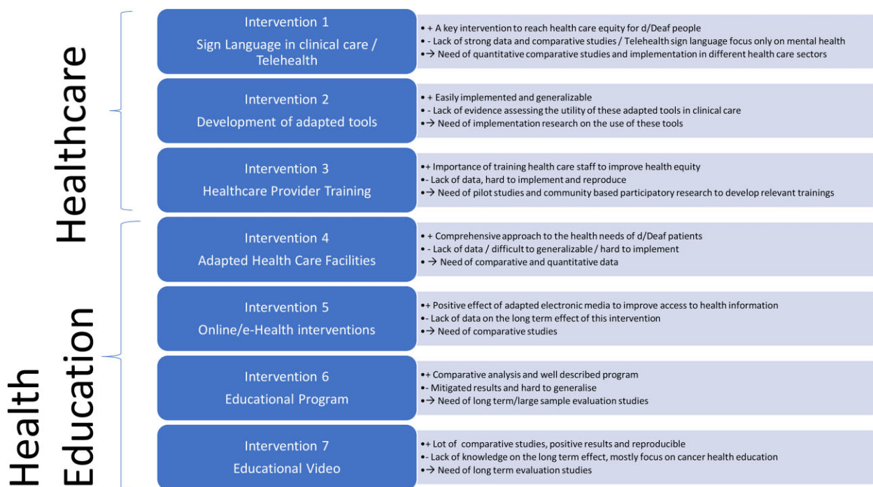
Figure 2 Synthesis of the results

Our systematic review has some limitations. First, populations included across analysed studies are heterogeneous (e.g. some included only those who identify as members of the Deaf community, whereas others mentioned Deaf Sign Language users who may or may not identify as members of the Deaf community). However, our initial focus was explicitly on d/Deaf people (we purposely excluded hard of hearing people), limiting the heterogeneity of the analysed population. Second, the literature is heavily US-focused (83% of identified studies were conducted in the USA) and therefore limits the transferability of the findings. This is probably due to well-established research groups specifically composed of d/Deaf researchers in the USA. Third, the quality and bias assessment highlighted some methodological issues concerning the selected studies. However, many of these methodological limitations are probably associated with the study population, which is too often overlooked in the medical literature (e.g. the small sample size). Finally, numerous articles were found that describe an intervention but did not conduct or report an empirical evaluation of its impact. We believe